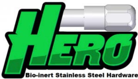
Fig. 1: Shepard Industries' logo for their Dursan-coated, bio-inert, Hero line.

Shepard Industries has acquired multiple new customers and helped existing customers solve complex issues within the field. They now have a new product series, the Hero line, that they can offer to customers that solves a gap in the industry. The Dursan coating has added thousands of dollars to their bottom line , in just the first quarter of releasing the products.