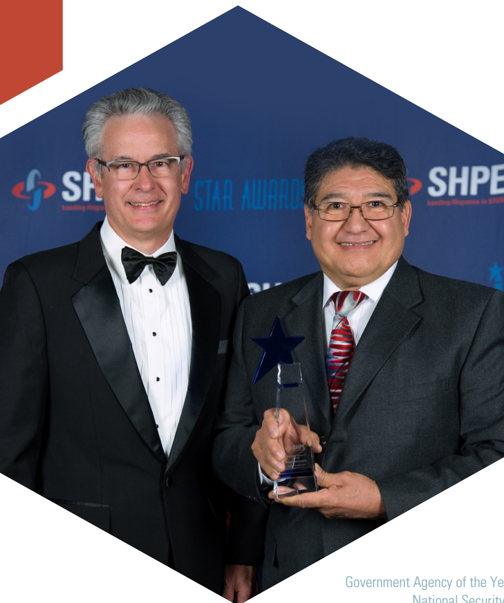
Government Agency of the Year 2022, National Security Agency