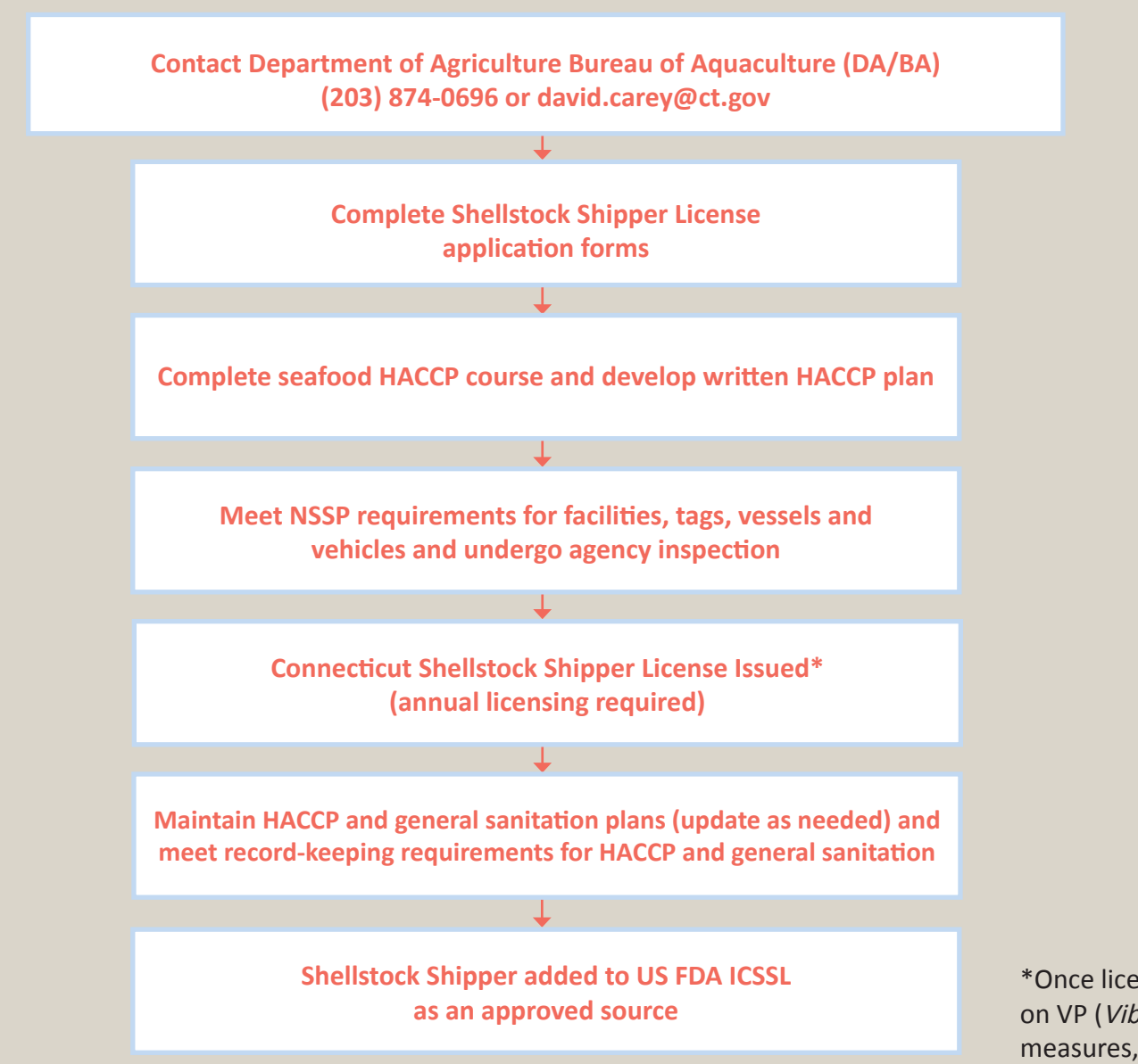
FIGURE 4. Connecticut requirements to become an approved source (Shellstock I/III License).

*Once licensed, DABA will provide guidance on VP ( Vibrio parahaemolyticus ) control measures, if applicable.