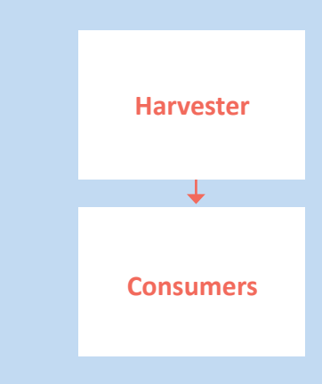
FIGURE 2. Direct Marketing Shellfish Distribution Chain