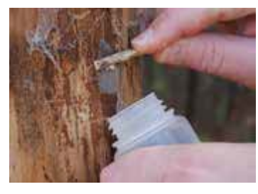
Figure 3. Scraping SLF egg masses from a tree.

The bark of mature tree-of-heaven looks similar to the outside of cantaloupe. When crushed, the leaves and stems have a foul odor that many describe as rotten peanut butter. They spread by seed and will also produce "clones" by their roots. This tree can mistaken other native species, including black walnut, hickory, and staghorn sumac. For help identifying and