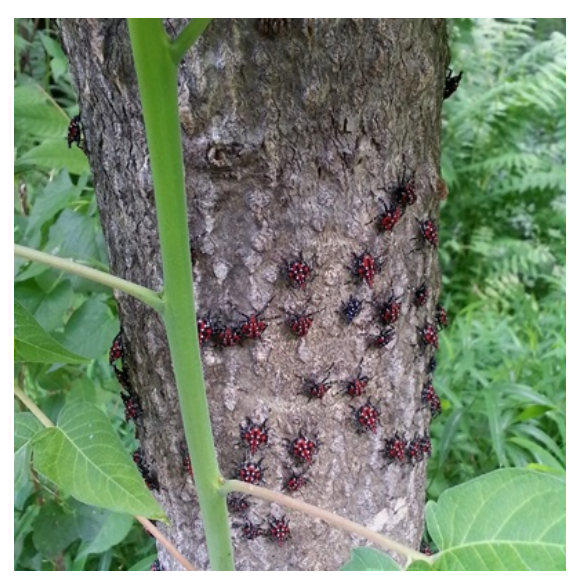
Figure 6. Late stage SLF nymphs.

number and a label with instructions for safe, appropriate, and legal use at sites (vegetation) where SLF may be found. Some insecticides available in other states or over the internet