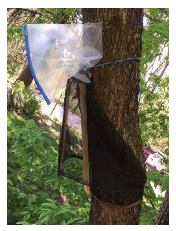
Figure 5. A funnel-style trap wrapped around a tree to capture SLF.