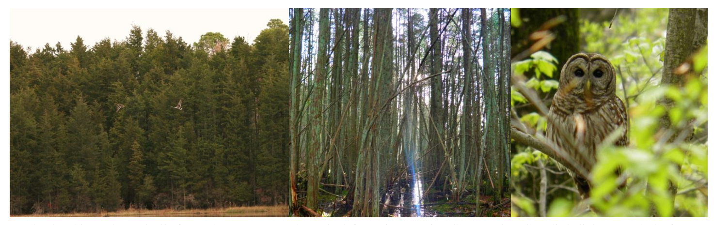
Atlantic white-cedar typically forms dense, even-aged stands (left) that allow little light to reach the forest floor (middle). These characteristics make this habitat type valuable for many plants and animals, including the state-threatened barred owl (right)

The Natural Resources Conservation Service (NRCS) offers technical and financial assistance to forest landowners through the Environmental Quality Incentives Program (EQIP). Eligible landowners with 10 acres of forest land may receive cost-share assistance for the development of a Forest Stewardship Plan, or for costs related to site preparation, invasive plant removal, seedling protection, and fencing when part of an approved Forest Stewardship Plan. Forest Stewardship Plans cost-shared through EQIP must be prepared by an NRCS-approved Technical Service Provider (TSP). A list of TSPs can be found at a local NRCS service center or on the New Jersey NRCS website.