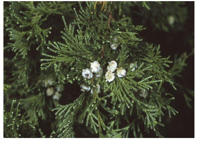
Atlantic white-cedar ( Chamaecyparis thyoides ) (©Robert Mohlenbrock, USDA, NRCS 1995)

Atlantic white-cedars typically grow in wetland areas with acidic soils. Mature forests form dense stands that allow little light to reach the forest floor. The herbaceous layer within these stands is normally comprised of hummocks of sphagnum moss, liverworts, ferns, insectivorous plants, and orchids. Atlantic white-cedar swamps provide vital resources and habitat to several rare orchids, including the crested yellow orchid ( Platanthera cristata ), and can also support populations