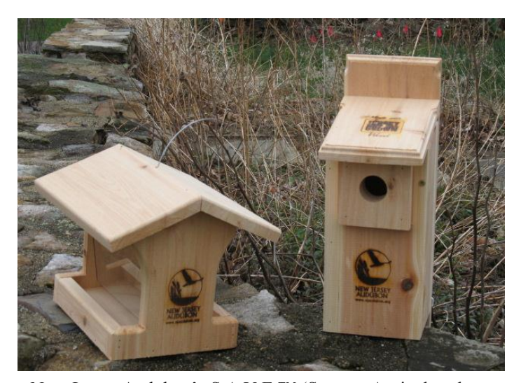
New Jersey Audubon's S.A.V.E.<sup>TM</sup> (Support Agricultural Viability and the Environment) program uses sustainable timber harvested from Atlantic white-cedar trees to create bird houses and bird feeders.