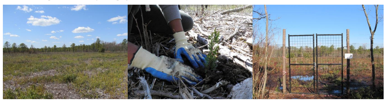
An old blueberry field (left) was cleared in order to create a new Atlantic white-cedar stand in Ocean County, NJ. The soil type in this particular site provides favorable conditions for Atlantic white-cedar, making it an excellent site for restoration. Under a Forest Stewardship Plan, seedlings were planted (middle) and a deer exclosure fence (right) was constructed to protect plants from browse.

A Forest Stewardship Plan will usually present the best options for Atlantic white-cedar management based on the landowner's goals and the site conditions. The landowner is typically responsible for the costs of development and implementation of a Forest Stewardship Plan. However, qualifying landowners in New Jersey have several options for obtaining technical and financial assistance for forest management.