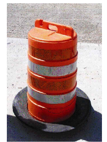
TYPICAL CHANNELIZING DEVICES