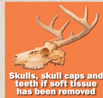
Skulls, skull caps and teeth if soft tissue has been removed