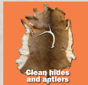
Clean hides and antlers