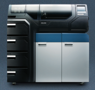
THINPREP 5000 AUTOLOADER<sup>8</sup>